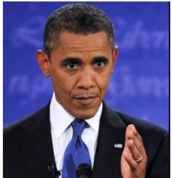
The Face of Deceit