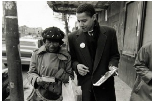
Obama community organizer

Obama comes from a community organizer background where it's us against them. But that's not who we are. And that's not the position the leader of our Nation should take." – Dr. Benjamin Carson