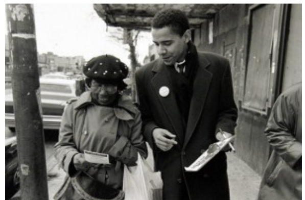
Obama community organizer

Obama comes from a community organizer background where it's us against them. But that's not who we are. And that's not the position the leader of our Nation should take." – Dr. Benjamin Carson