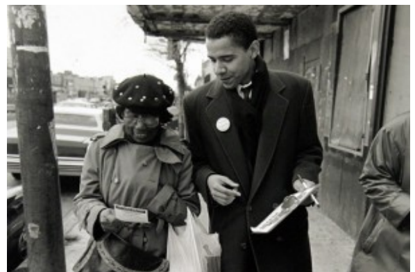
Obama community organizer

Obama comes from a community organizer background where it's us against them. But that's not who we are. And that's not the position the leader of our Nation should take." – Dr. Benjamin Carson