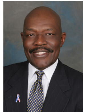
Mychal S. Massie

The truth is I do not like the Obamas, what they represent, their ideology, and I certainly do not like his policies and legislation. I've made no secret of my contempt for the Obamas. As I responded to the person who asked me the aforementioned question, I don't like them because they are committed to the fundamental change of my/our country into what can only be regarded as a Communist state.