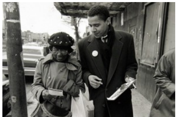
Obama community organizer

Obama comes from a community organizer background where it's us against them. But that's not who we are. And that's not the position the leader of our Nation should take." – Dr. Benjamin Carson