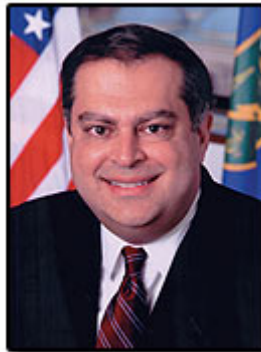
Senator Spencer Abraham

August 20, 1996 Bill authored by U.S. Rep. Susan Molinari (R-NY) to prohibit racial discrimination in adoptions, part of Republicans' Contract With America, becomes law