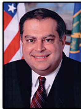
Senator Spencer Abraham

August 20, 1996 Bill authored by U.S. Rep. Susan Molinari (R-NY) to prohibit racial discrimination in adoptions, part of Republicans' Contract With America, becomes law