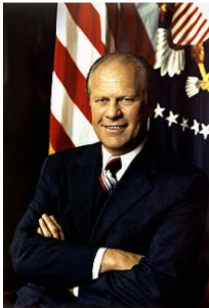
President Gerald Ford

Using the laws and agencies that were established during the Nixon administration, AT&T entered into a consent decree with the EEOC and the Department of Labor (regarding a discrimination case) in which AT&T was required to pay $15 million in reparations and to allocate $23 million each year to raise the pay of blacks and other minorities and women. It was the largest discrimination settlement in U.S. History at that time.