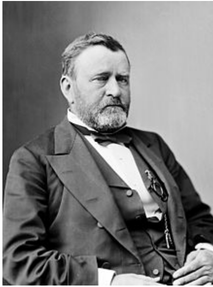
Ulysses S. Grant

October 22, 1868 While campaigning for re-election, Republican U.S. Rep. James Hinds (R-AR) is assassinated by Democrat terrorists who organized as the Ku Klux Klan