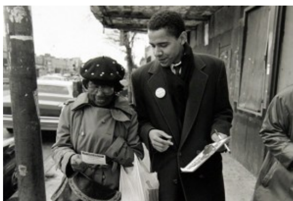
Obama community organizer

Obama comes from a community organizer background where it's us against them. But that's not who we are. And that's not the position the leader of our Nation should take." – Dr. Benjamin Carson