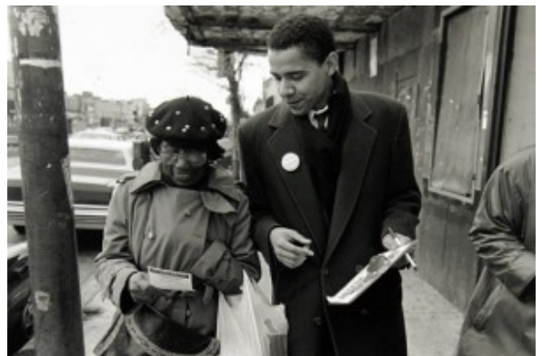
Obama community organizer

Obama comes from a community organizer background where it's us against them. But that's not who we are. And that's not the position the leader of our Nation should take." – Dr. Benjamin Carson