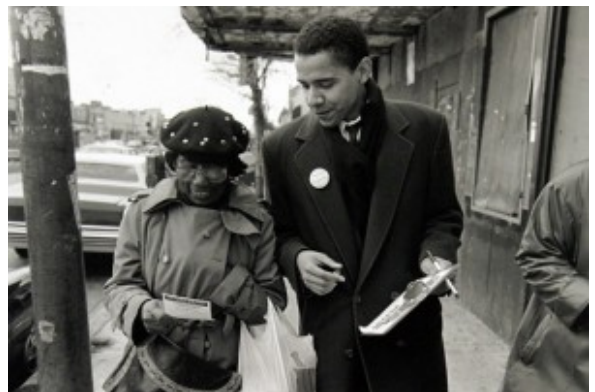
Obama community organizer

Obama comes from a community organizer background where it's us against them. But that's not who we are. And that's not the position the leader of our Nation should take." – Dr. Benjamin Carson