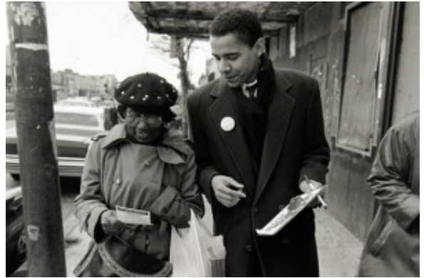
Obama community organizer

Obama appears to be a tormented man who is filled with resentment, anger, and disdain for anyone of an opinion or view other than his. He acts in the most hateful, spiteful, malevolent, vindictive ways in order to manipulate and maintain power and control over others. Perhaps because, as a child, he grew up around family members and mentors who instilled him with an abiding bitterness toward the U.S. That bitterness seems not to have left him.