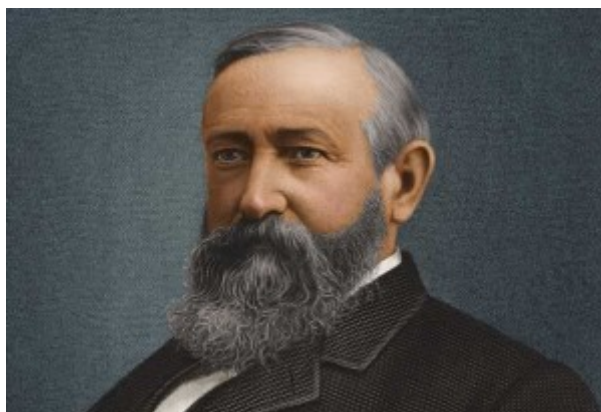
President Benjamin Harrison

August 30, 1890 Republican President Benjamin Harrison signs legislation by U.S. Senator Justin Morrill (R-VT) making African-Americans eligible for land-grant colleges in the South