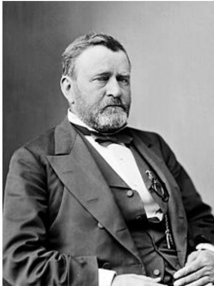
Ulysses S. Grant