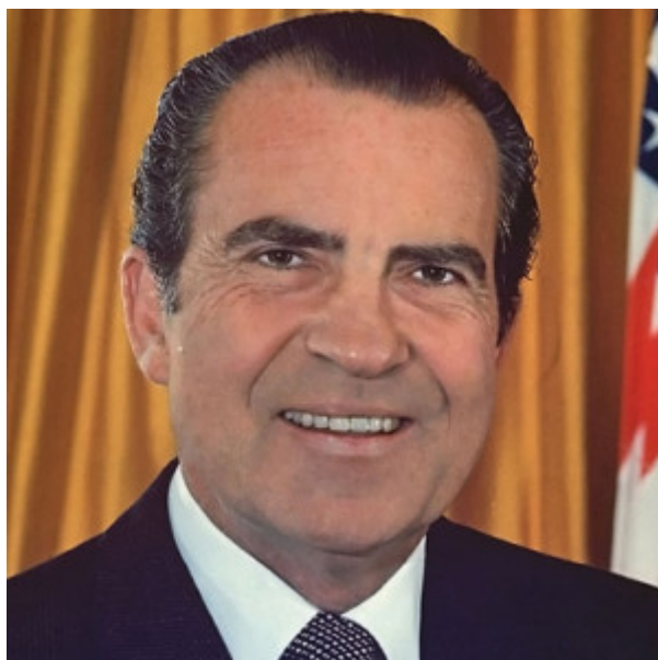
President Richard Nixon

July 8, 1970 In special message to Congress, President Richard Nixon calls for reversal of policy of forced termination of Native American rights and benefits.