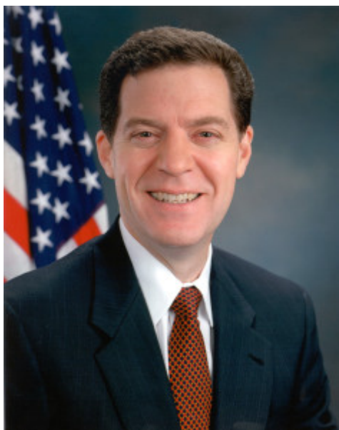
Senator Sam Brownback

May 23, 2003 U.S. Senator Sam Brownback (R-KS) introduces bill to establish National Museum of African American History and Culture