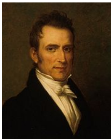
Supreme Court Justice John McLean

May 22, 1856 For denouncing Democrats' pro-slavery policy, Republican U.S. Senator Charles Sumner (R-MA) is beaten nearly to death on floor of Senate by U.S. Rep. Preston Brooks (D-SC), takes three years to recover.