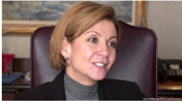
Rep. Susan Molinari

Rights Act of 1991 to strengthen federal civil rights legislation