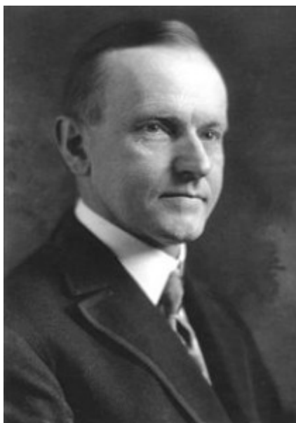
President Calvin Coolidge

June 2, 1924 Republican President Calvin Coolidge signs bill passed by Republican Congress granting U.S. citizenship to all Native Americans.