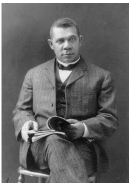
Republican Booker T. Washington

May 24, 1900 Republicans vote no in referendum for constitutional convention in Virginia, designed to create a new state constitution disenfranchising African-Americans