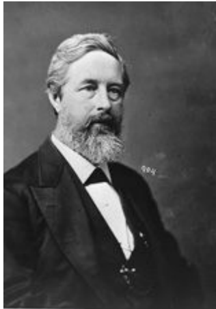
Senator Aaron Sargent

September 20, 1876 Former state Attorney General Robert Ingersoll (R-IL) tells veterans: "Every man that loved slavery better than liberty was a Democrat. I am a Republican because it is the only free party that ever existed."