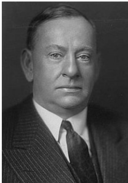
Rep. Leonidas Dyer

August 18, 1920 Republican-authored 19th Amendment, giving women the vote, becomes part of Constitution; 26 of the 36 states to ratify had Republican-controlled legislatures. (You can learn more about how the 19th Amendment got passed at The American Spectator)