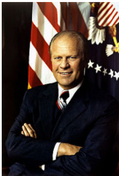
President Gerald Ford

Using the laws and agencies that were established during the Nixon administration, AT&T entered into a consent decree with the EEOC and the Department of Labor (regarding a discrimination case) in which AT&T was required to pay $15 million in reparations and to allocate $23 million each year to raise the pay of blacks and other minorities and women. It was the largest discrimination settlement in U.S. History at that time.