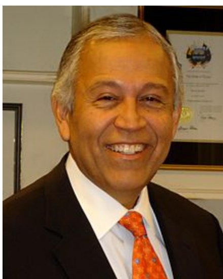
Rep. Henry Bonilla

May 23, 2003 U.S. Senator Sam Brownback (R-KS) introduces bill to establish National Museum of African American History and Culture