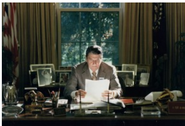
President Ronald Reagan

September 15, 1981 President Ronald Reagan establishes the White House Initiative on Historically Black Colleges and Universities, to increase African-American participation in federal education programs.