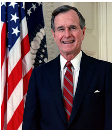
President George H. W. Bush

August 10, 1988 President Ronald Reagan signs Civil Liberties Act of 1988, compensating Japanese-Americans for deprivation of civil rights and property during World War II internment ordered by FDR.