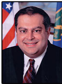
Senator Spencer Abraham

August 20, 1996 Bill authored by U.S. Rep. Susan Molinari (R-NY) to prohibit racial discrimination in adoptions, part of Republicans' Contract With America, becomes law