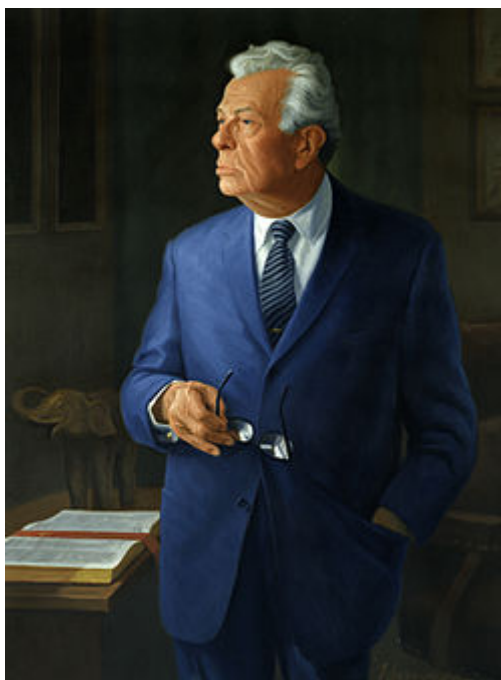
Senator Everett Dirksen

June 10, 1964 Senate Minority Leader Everett Dirksen (R-IL) criticizes Democrat filibuster against 1964 Civil Rights Act, calls on Democrats to stop opposing racial equality